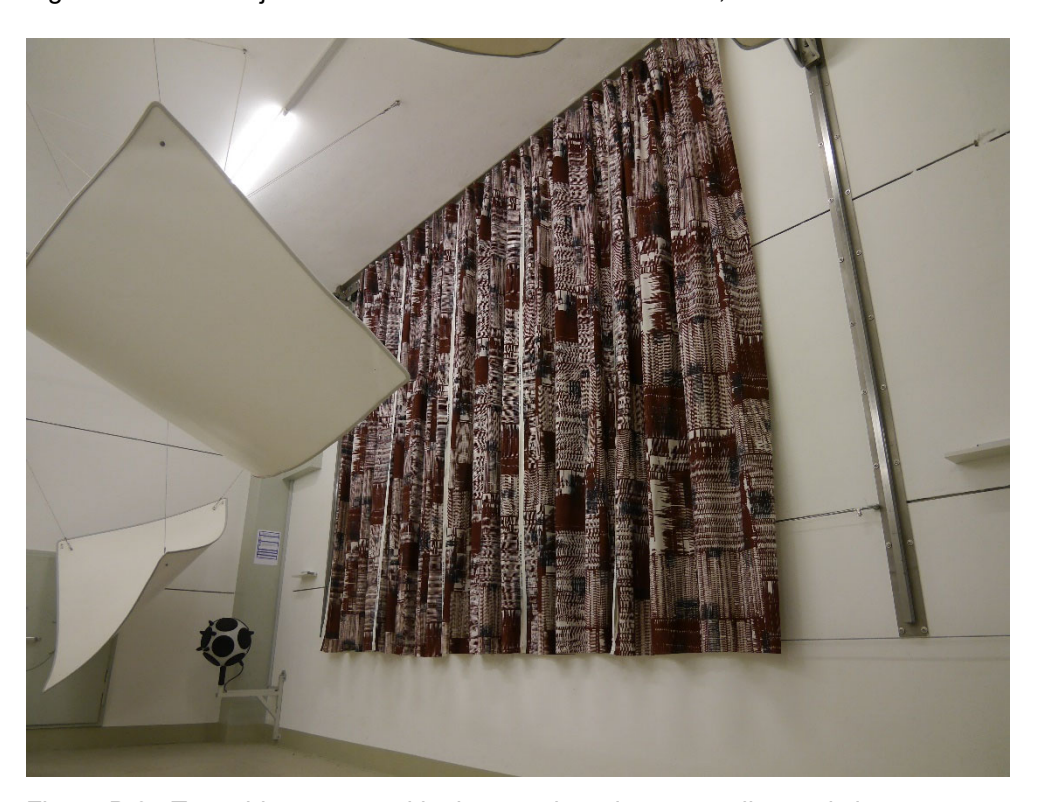
Figure B.2. Test object mounted in the reverberation room, diagonal view.